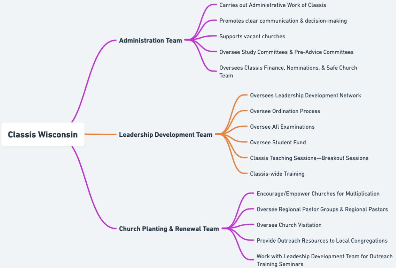
Diagram of Three-Team Structure